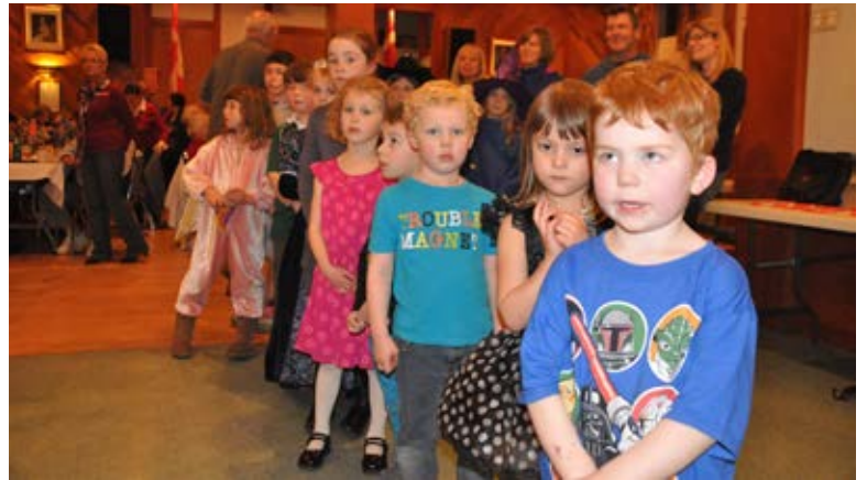
February 15, 2015 Fastelavn

Smørrebrød May 21/2016 Our members that makes it all get together.