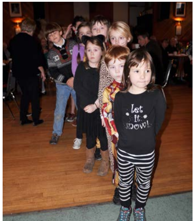
February 15, 2016 Fastelavn