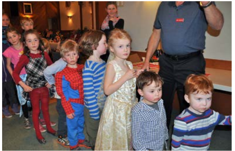
February 14, 2014 Fastelavn