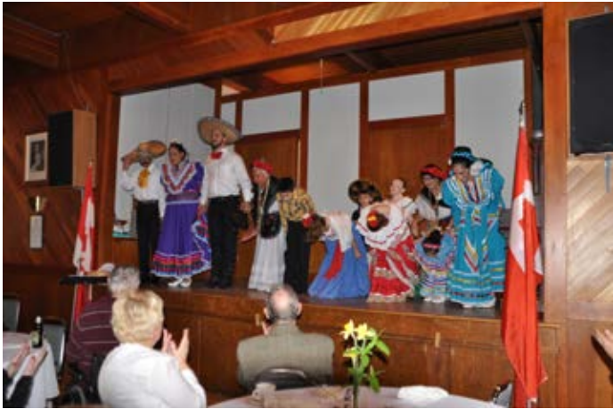
March 22, 2014, Mexican Dancers provided delightful dancing.